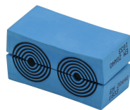
EM module with Multidiameter™