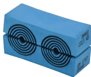
GM module with Multidiameter™